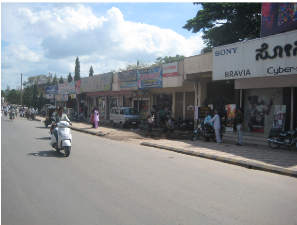
Photo: Showing the current shops, above which the offices would be constructed.