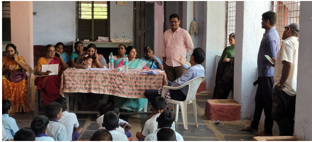
Photo: Juvenile Justice Act inspection team at the Halvi Hostel in November

(We believe that what appears an irregular pattern is due to 2 years of Covid disruption).