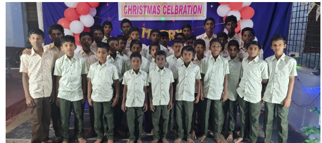
Photo: Some of the boys at the Halvi Hostel Christmas celebrations in their new clothes

Finally, as is the custom at the end of term in December, Christmas celebrations take place in the Hostel and all boys receive a new set of clothing. (This is always included as part of the Hostel budget). It is great to see that normality is returning (even if some of their performances are very amusing)!