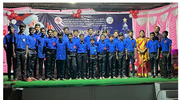
Photo: Christmas celebrations at the Bellary hostel – also all with new clothes (plus the Warden and his wife)